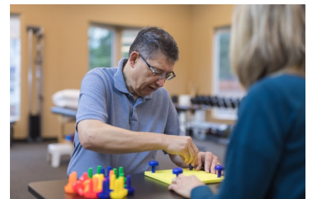
Rehabilitation Intensity Element 3 The patient was actively engaged in the activity throughout the session.